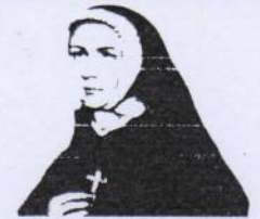
St. Claudine Thevenet (Mary St. Ignatius)

t. : +91 135 2632747 | e : cjmwaverleymussoorie@gmail.com | w : www.cjmwaverley.org